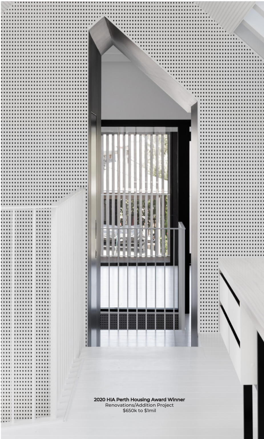
2020 HIA Perth Housing Award Winner Renovations/Addition Project $650k to $1mil